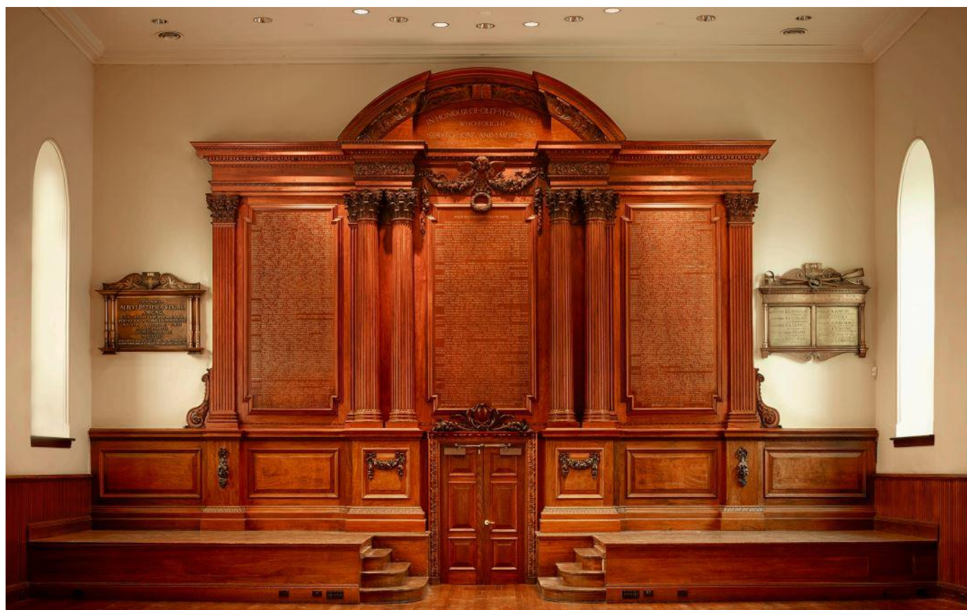
Sydney Grammar School Honour Board