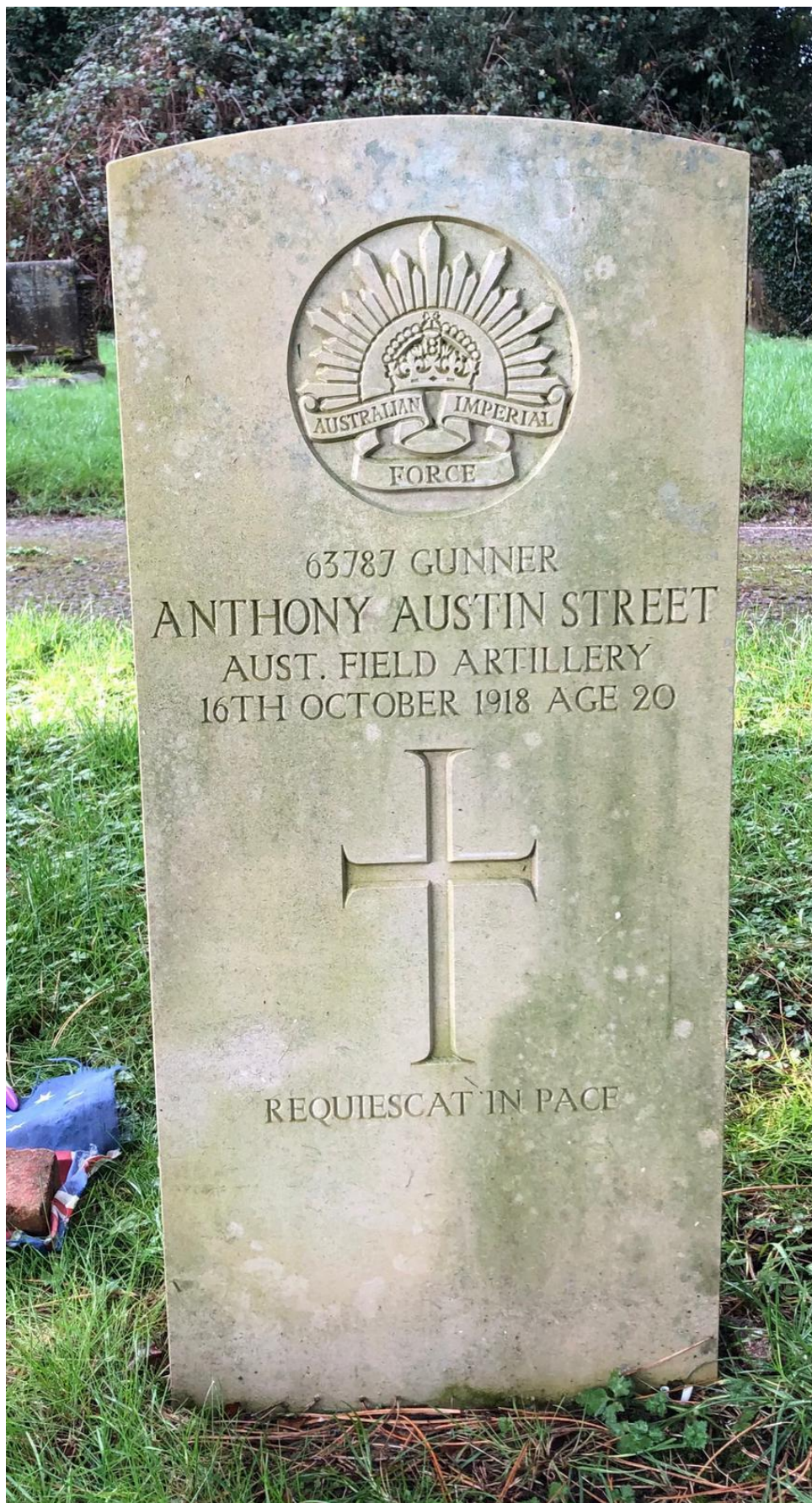
Photo of Gunner Anthony Austin Street's Commonwealth War Graves Commission Headstone in London Road Cemetery, Salisbury, Wiltshire, England.